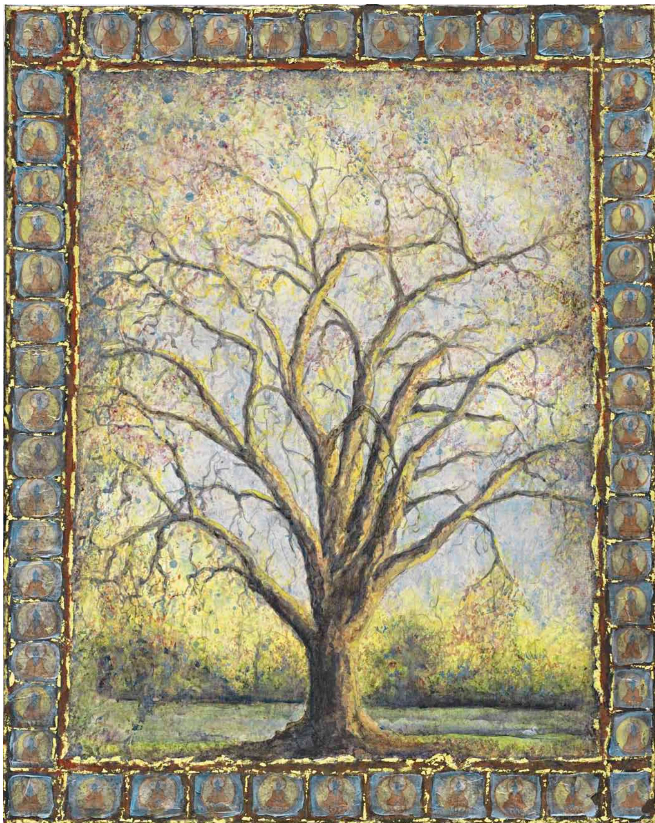
Trees are the symbols of resilience, patience, endurance and fruitfulness; qualities all eco-activists aspire to The Heart of Silence by Pat Silbert